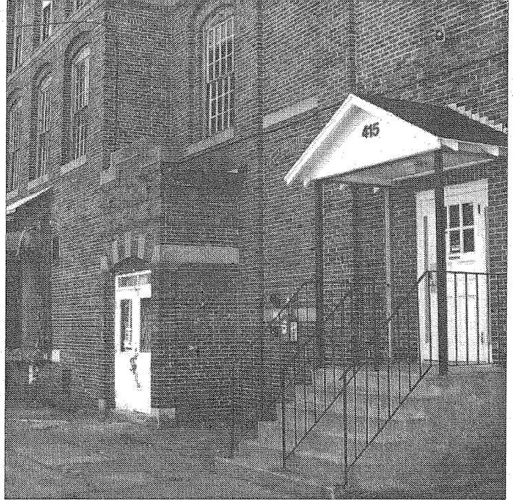
$1 million has been committed through the New Hampshire Housing Finance Authority for the Silver Mill Apartments project at 415 Silver St., above right, where Manchester Neighborhood Housing Services is converting the rundown building into 57 units of low-cost family housing. Above left is the rear of the vacant building.